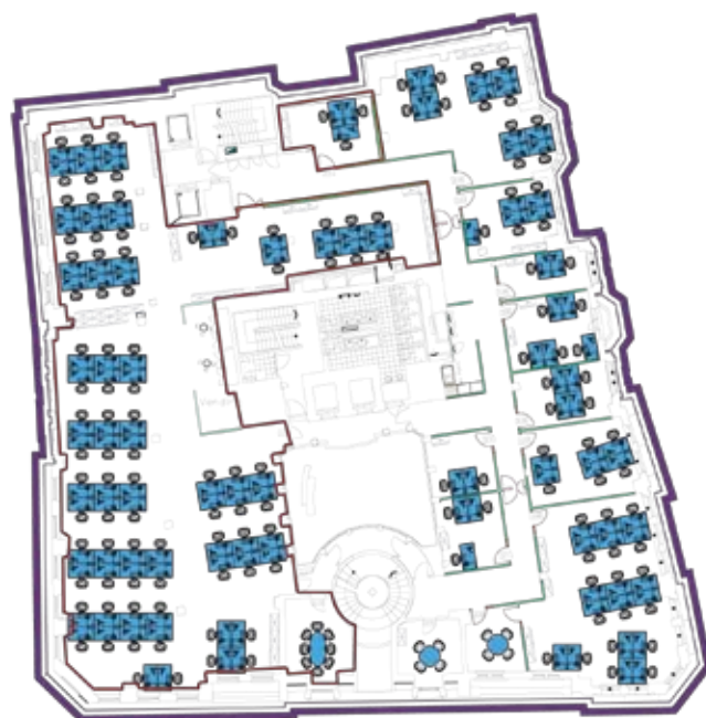
Indicative layout of part third floor

info@apm-property.com | www.apm-property.com